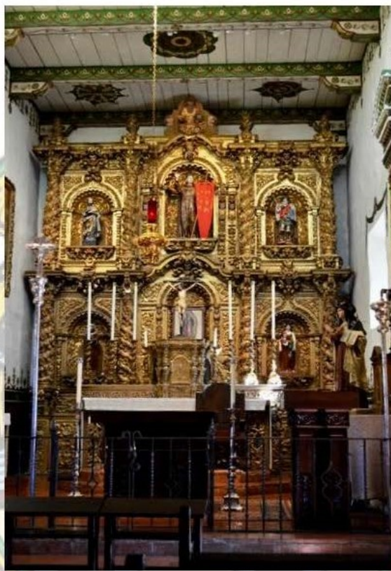
St Junipero Serra Chapel Old Mission San Juan Capistrano

Here's wishing everyone a very Happy, Healthy and Prosperous New Year. May we all strive to continue to live up to the Mission of the Serra Club of North Central Dallas as expressed on our website :